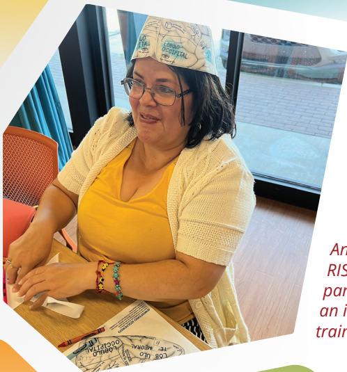
An Educadores RISE provider participates in an interactive training activity.